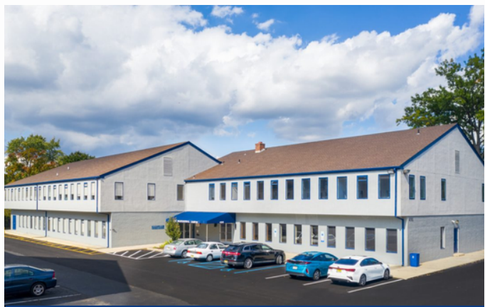
MULTI-TENANT OFFICE & MEDICAL