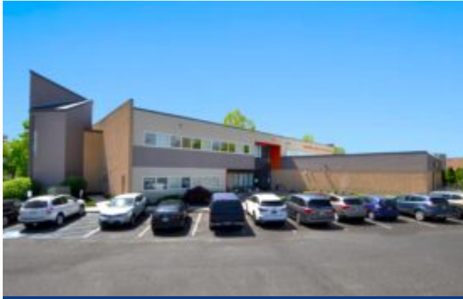
SINGLE TENANT MEDICAL