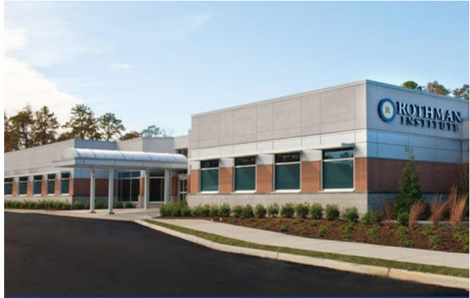
SINGLE TENANT MEDICAL