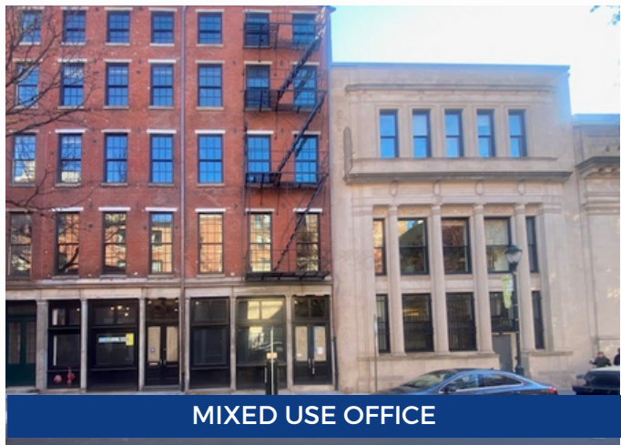
MIXED USE OFFICE