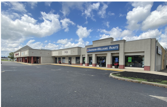
MULTI-TENANT RETAIL & OFFICE