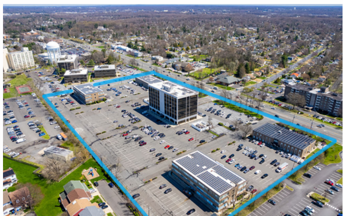
MULTI-TENANT OFFICE & MEDICAL PORTFOLIO