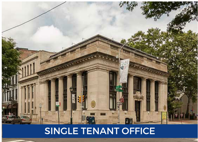
SINGLE TENANT OFFICE