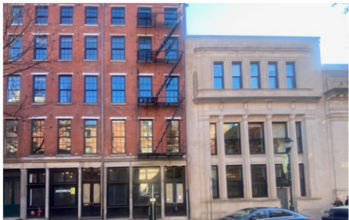
MIXED USE OFFICE